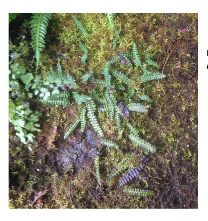
Fig 5 – The different growth habit of Blechnum penna-marina growing in moss.