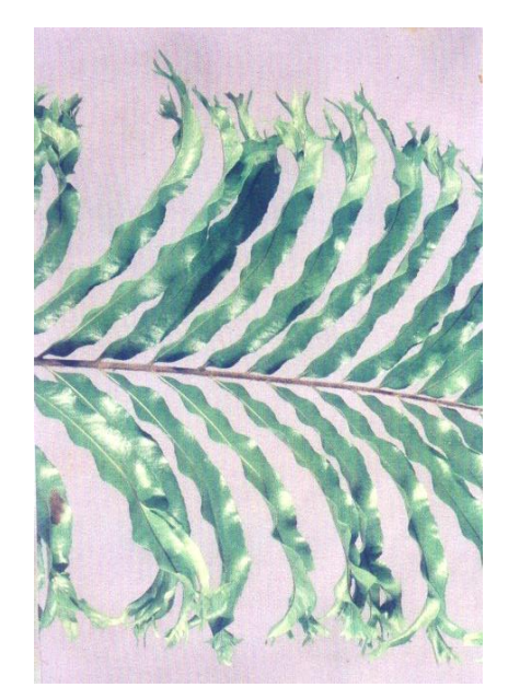
D. rigidula 'Cristata obtusa' Hort.