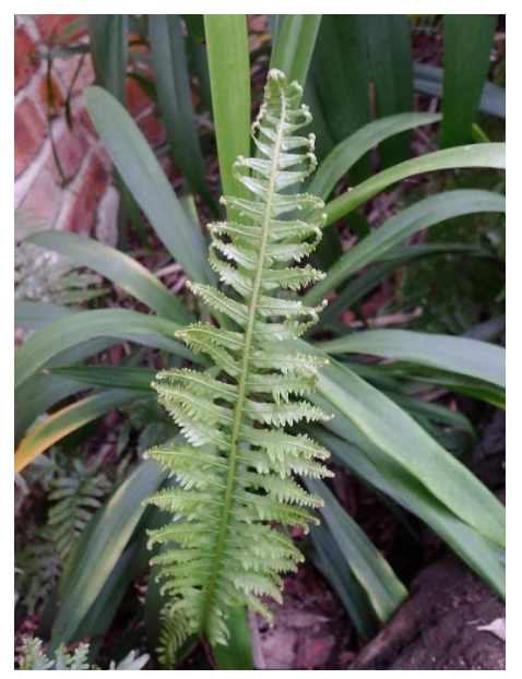
Blechnum nudum from King Island

There wasn't really a topic, everyone was too busy looking at the garden. There was also lots of food. Our meetings are really more like cake meetings than fern meetings