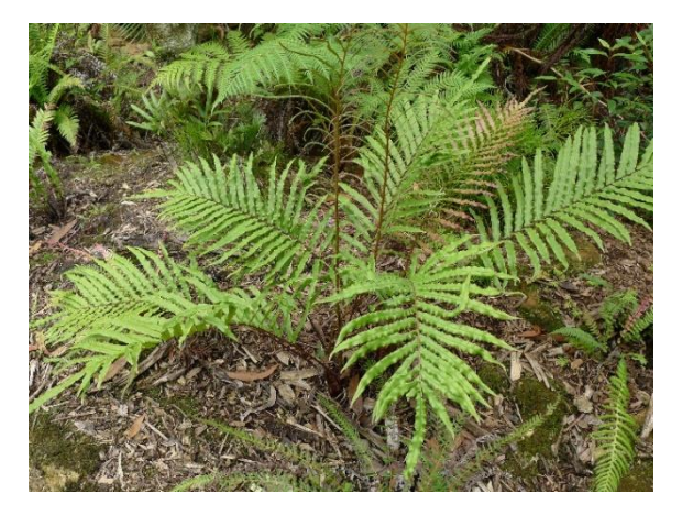
Blechnum wurunuran from Ian's garden