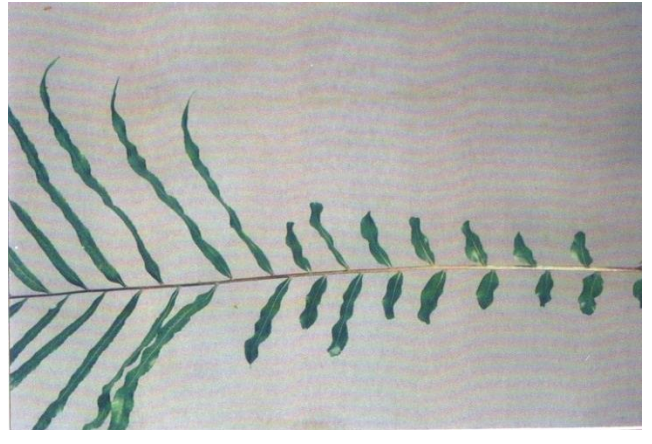
D. rigidula 'Dimorpha pinnata' Hort.