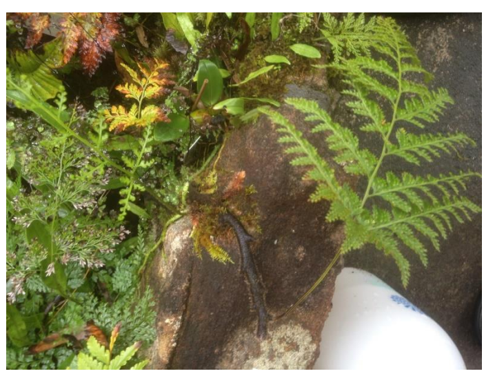
Fig 4 – The same Davallia plant where there is moss to help it hold the rock.