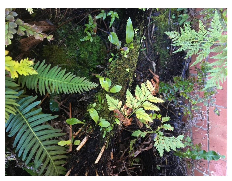
Fig 2 – In a garden where Niphidium spore is presumably fairly evenly distributed around the adult Niphidium , this is the only place where that spore germinates – on a particular moss.