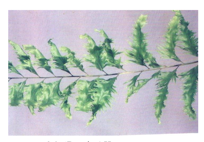
D. rigidula 'Dansiae' Hort.