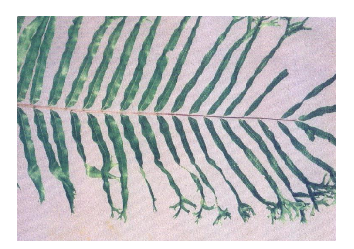
D. rigidula 'Cristata' Somerset Dam form