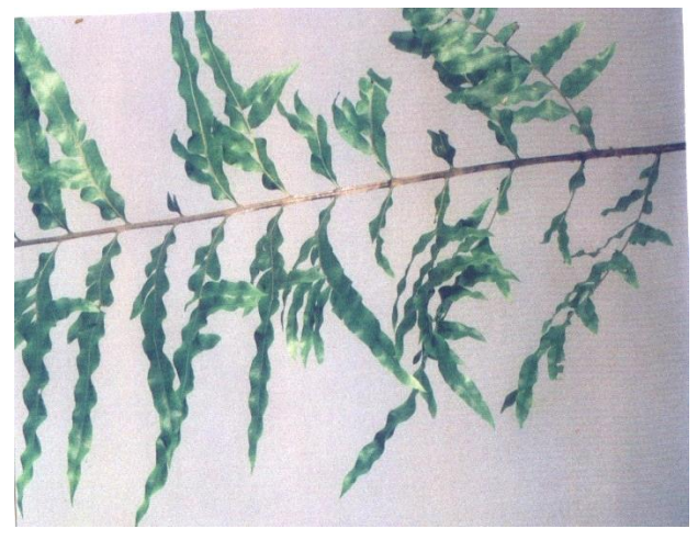
D. rigidula 'Diversipinnae' Kulangoor form