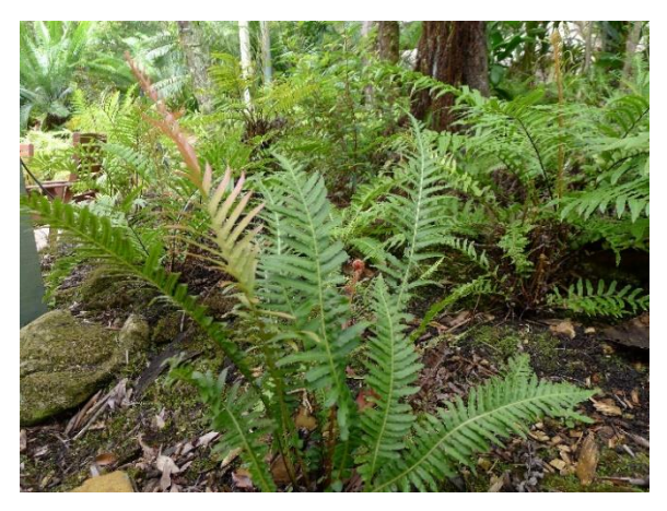
Blechnum nudum x Doodia