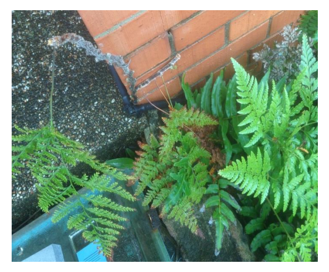
Fig 3 – Davallia trichomanoides seems unable to grip the wall without help (there's a wire that holds it part of the way).