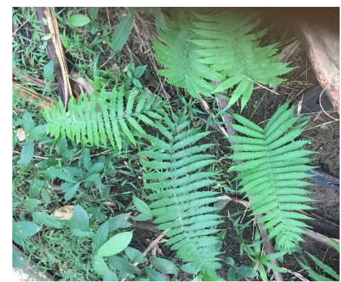
Christella dentata & C. parasitica

forests in the area. High on palms near the creek, small specimens of Pyrrosia and Platycerium epiphytes were observed, and on the flatter, more flood prone area near the creek, Arachniodes aristata , Adiantum diaphanum , Christella dentata , Christella parasitica , and Lastreopsis microsora were seen. Christella dentata is common in less developed areas around Buderim, being perhaps the most common fern on our house block, and around Buderim it is not uncommon to see C. parasitica near C. dentata . To the right is a photo or the two together, taken on an exploratory trip to Ninox Reserve. C. dentata has the lower pinnae on the fronds reducing to a quite small size while the lower pinnae on the C. parasitica frond are much larger. Also, C. dentata is clumping while C. parasitica is long-creeping.