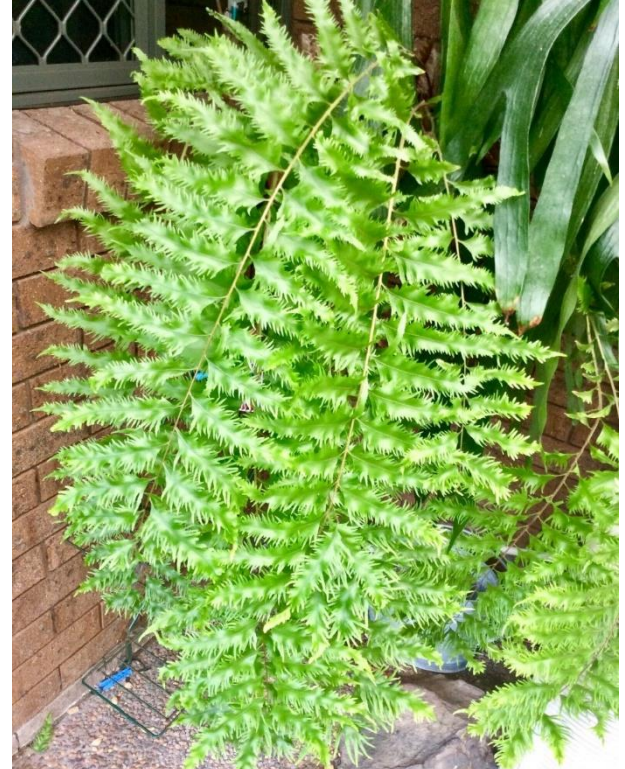
Pinna of D. rigidula 'Juliae' Hort.