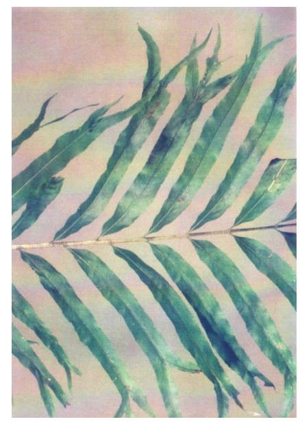
D. rigidula 'Bifida' Hort.