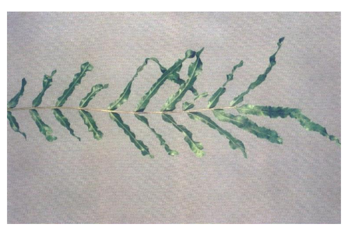
D. rigidula 'Distortum' Hort.