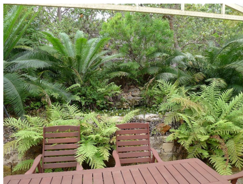
View of Ian's garden with pond