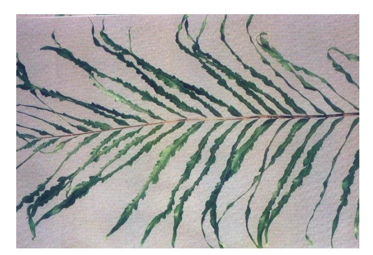
D. rigidula 'Erosum' Hort.